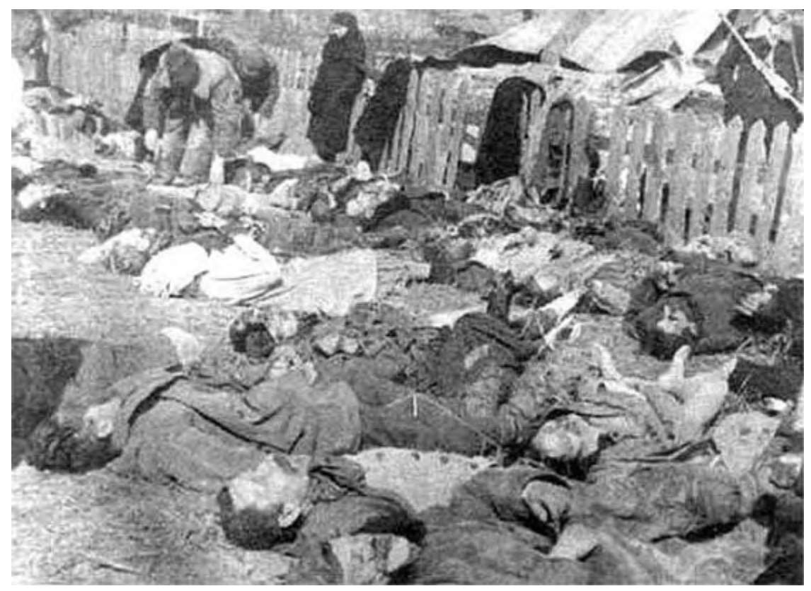
The Polish victims of the massacre in the village of Lipnik in Wolyn (Volhynia) committed by the rebellious Ukrainian Army, in 1943

Already in 1944, the Russian marshals asked Stalin to establish a military tribunal, which could convict the Ukrainian butchers guilty of the massacres and sentence them to death.